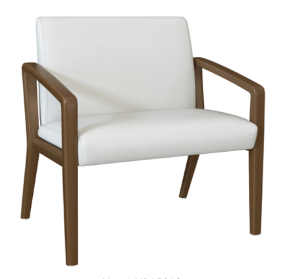
Model: MDAB34G 34W 27D 35H 29.5SW 18.5SD 19SH 26AH

The cushioned seat of the Modena Bariatric - 34W extends slightly to support and deliver more comfort to thighs and behind the knees. Reinforced steel under the seat supports 500 pounds. The flex frame connects from the seat of the chair to the back and consists of three custom brackets and horizontal support. The seat, arms and legs remain stationary to deliver ergonomic support as the user changes position while seating. The Modena Guest chairs are suitable for multiple healthcare locations including patient rooms.